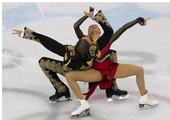
How do you make a spider on the ice? Just try this move by Olympic gold medallist in ice dance, Tatiana Navka and Roman Kostamarov.