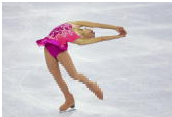
Even though she didn't get to the Olympics, Alissa Czisny still can impress with this amazing layback spin