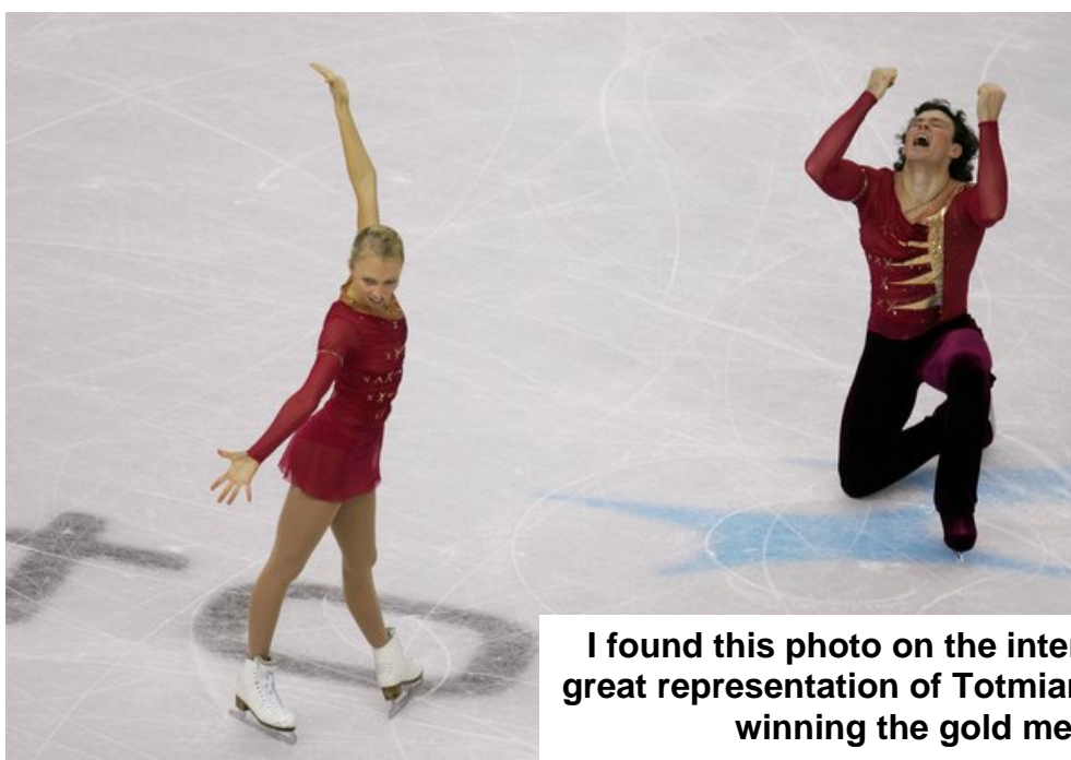
I found this photo on the internet – what a great representation of Totmianina & Marinin winning the gold medal!

Short track speed skating and figure skating will be showcased at the Festival for the first time in Sydney in January 2007.