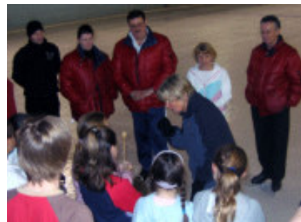
Everyone paying attention!!!