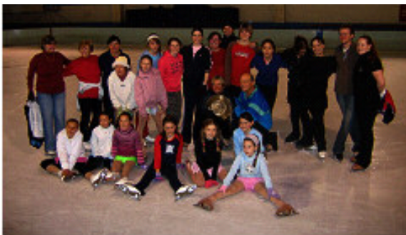
The Beginners Group from the lunchtime session